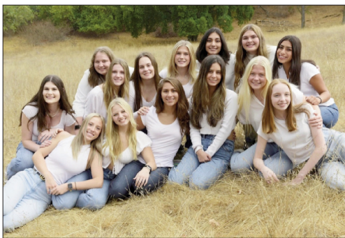
The Almaden Blossom Valley Chapter of the National Charity League (NCL) Class of 2022.

The senior class will be responsible for building, decorating, and installing four new Little Free Libraries in our community. They will also be filling the libraries with a variety of books that they will continue to restock. The class will also incorporate the "Read in Color"