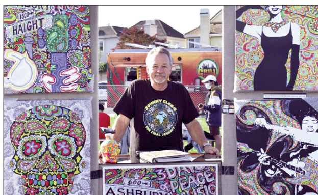
The Festival of Thanks featured art, games and food trucks.