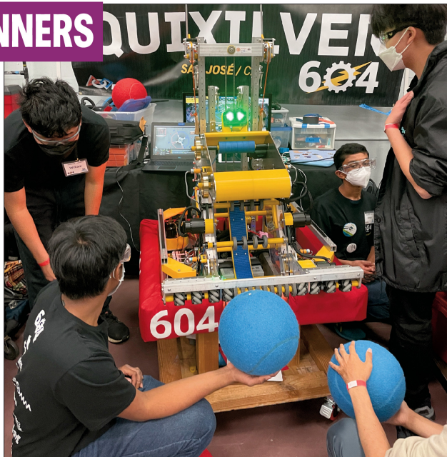
Almaden's Leland High School's 604 Quixilver Robotics Team won the San Francisco Regional competition at St. Ignatius College Preparatory on March 20.