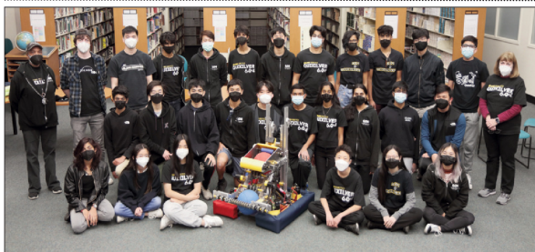
The Leland Quixilver Robotics Team will be competing at the Silicon Valley Regional (SVR) on April 8 through April 10.